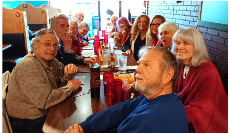
A dozen SLC family members gathered at Casa Tequila for lunch and fellowship following a recent Sunday service. Impromptu Sunday lunches are a tradition at SLC and a great opportunity to become better acquainted and discuss the topic of the day.

Do you like to chat on the phone? How about calling members who are sick or otherwise unable to attend. Other opportunities include speakers, greeters, facilitators, manning the music board, decorating, help with maintenance. Let any board member know how you would like to help.